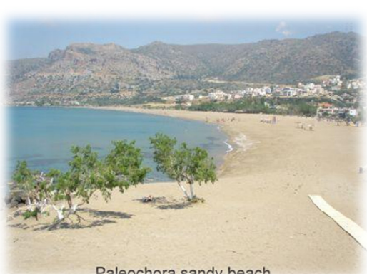
Paleochora sandy beach